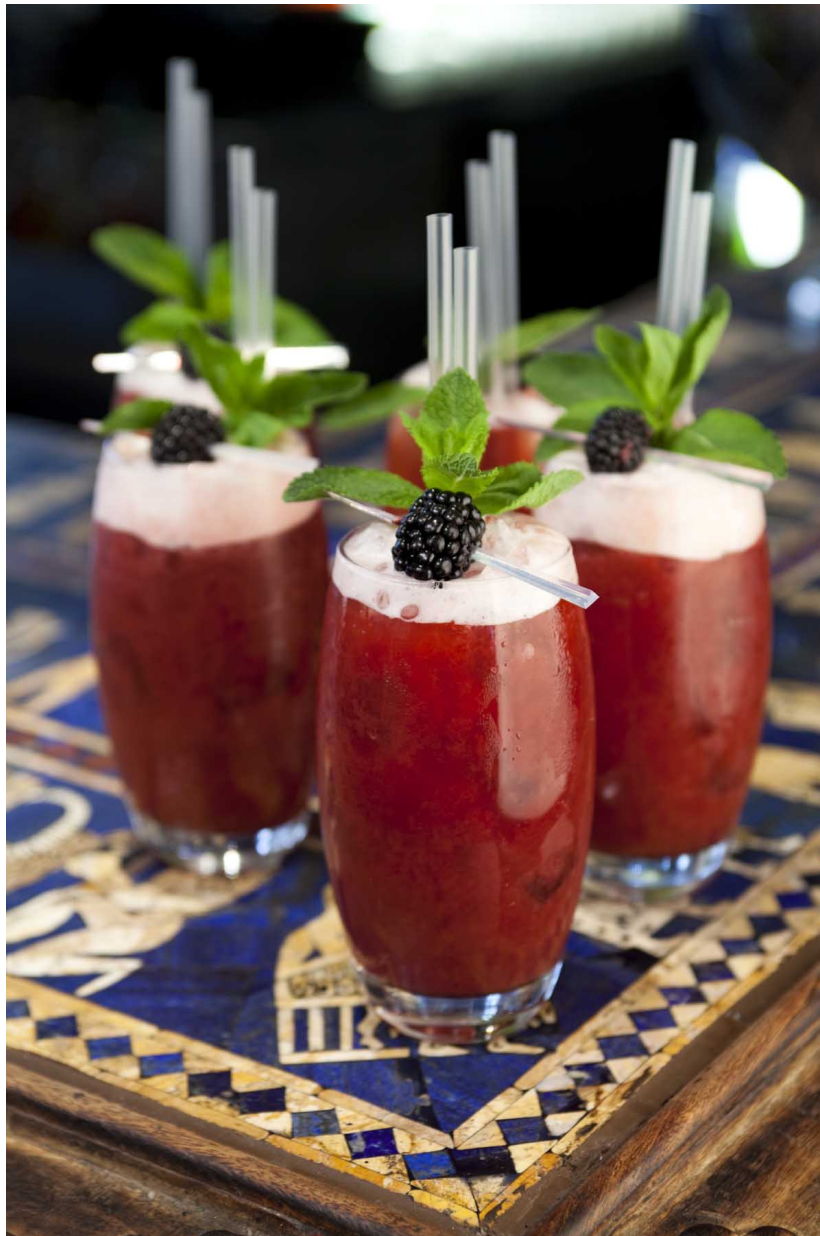
Above: 'Four-Play'. A Specially Concocted Signature Cocktail @ Gilgamesh.

The birthday festivities will culminate in a celebrity party on the evening of Thursday 12th August, featuring famous DJs, Wonderland-themed live dancers and musicians. Attire is strictly Tea Party. Other treats will include the Queen of Heart's Playing cards patrolling, a real life Mad Hatter cavorting, and bowls of sweets labeled 'Eat Me'. Cocktails will be served in teacups and revelers can dance until dawn on a chessboard dance floor.